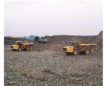
Mining Operational Solutions