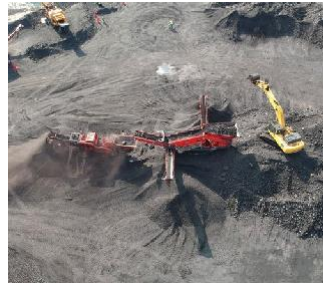
Hard Rock Mining, Screening & Crushing